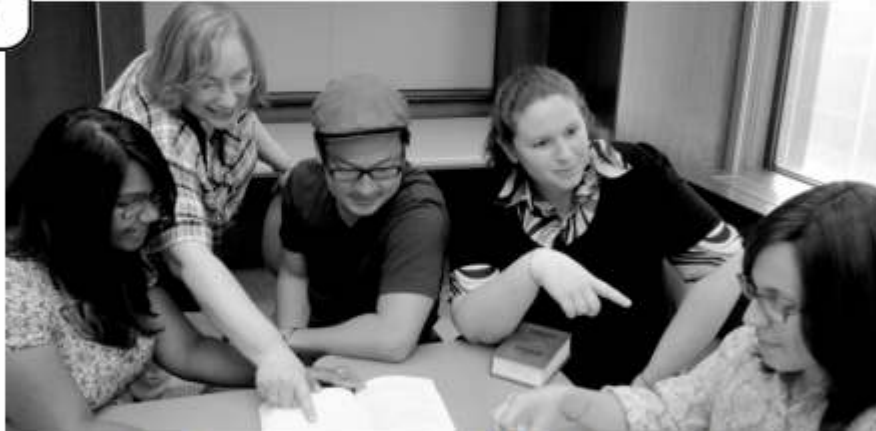
Offered by the Union for Reform Judaism in partnership with the Chicago Association of Reform Rabbis

A 17-week course covering topics about living Jewishly, including: practice and observance, beliefs, creating a Jewish home, life cycle observances, synagogue and prayer, history, shabbat and holidays, basic Hebrew, and choosing Judaism.